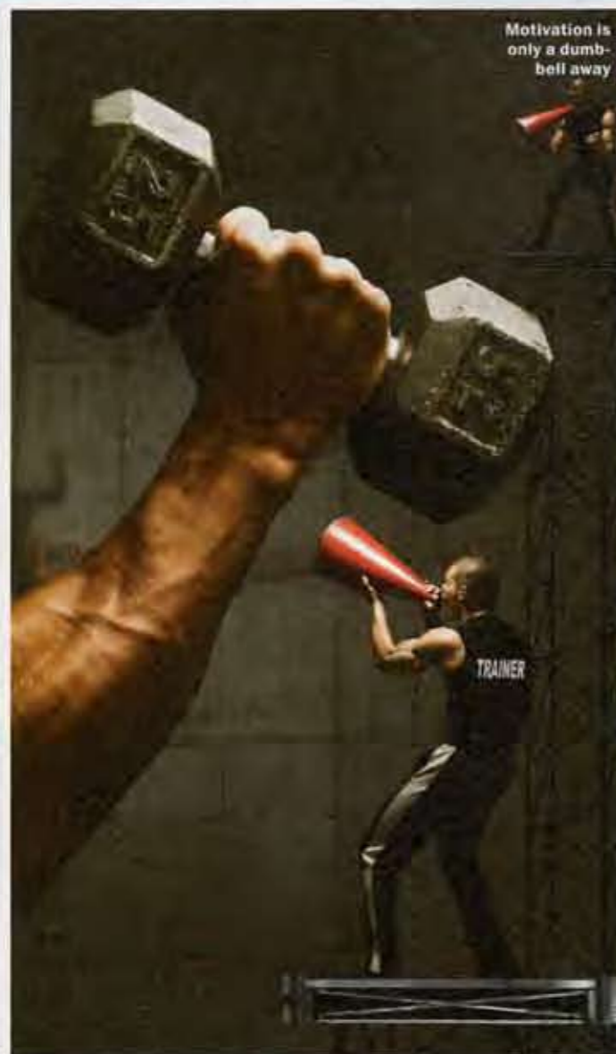
Motivation is only a dumb-bell away