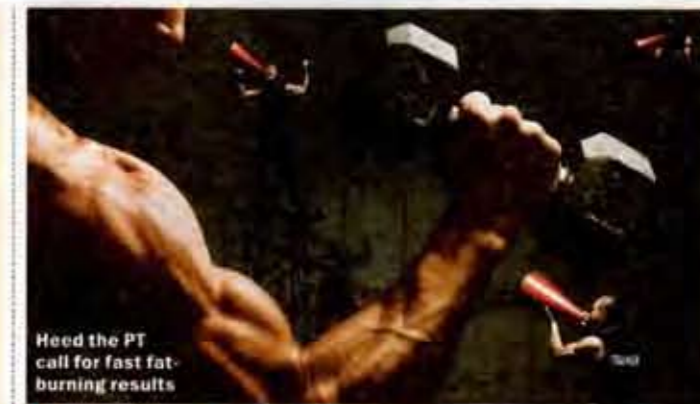
Heed the PT call for fast fat-burning results